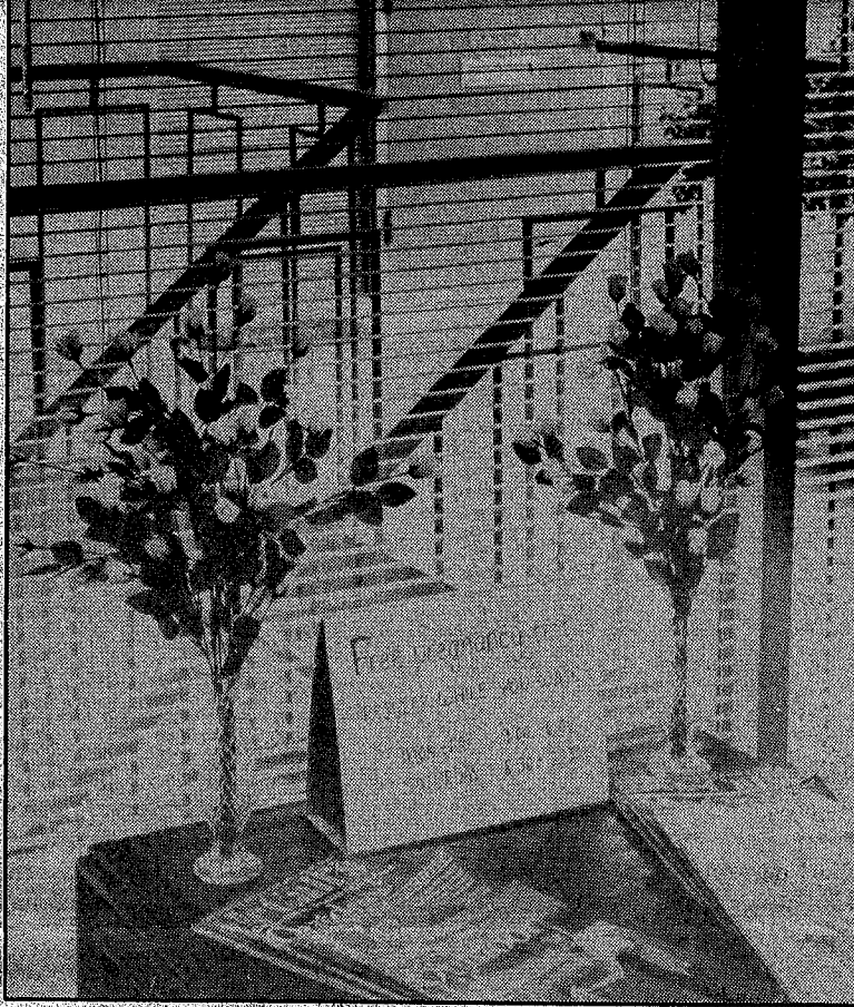
The abortion clinic across the hall from the White Rose Women's Center can be seen through the front windows of the anti-abortion clinic.